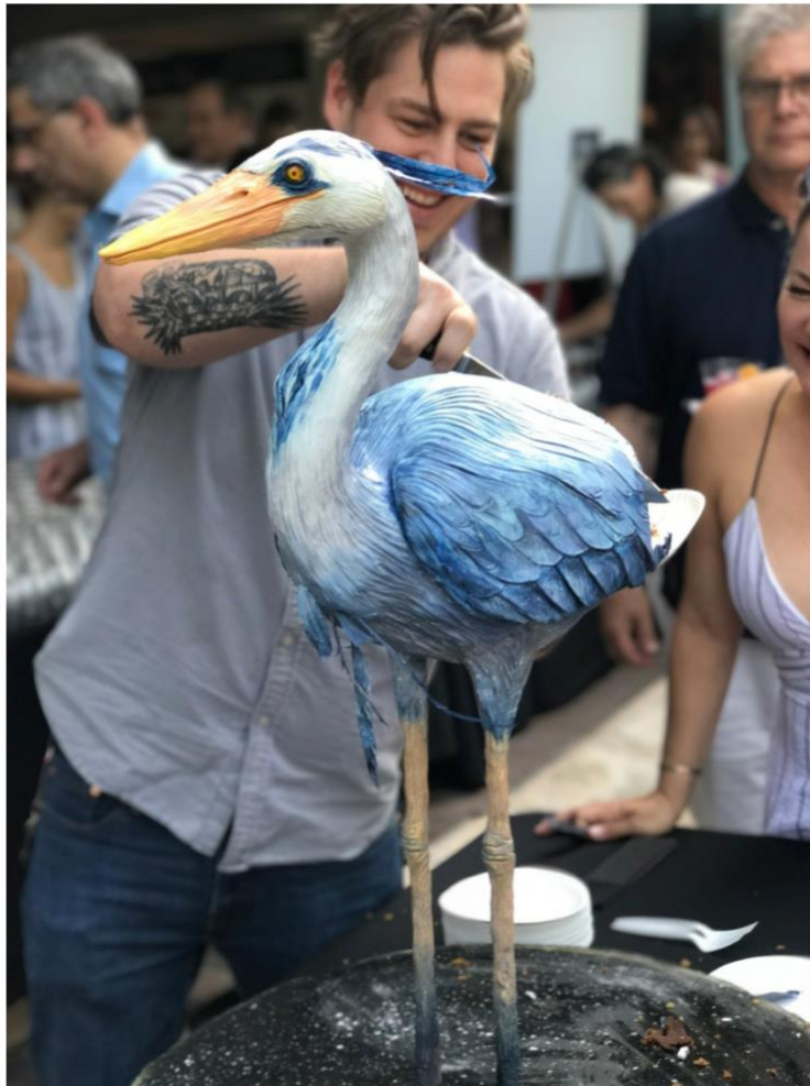
This blue heron cake will be featured on Saturday's episode of "Texas Cake House."