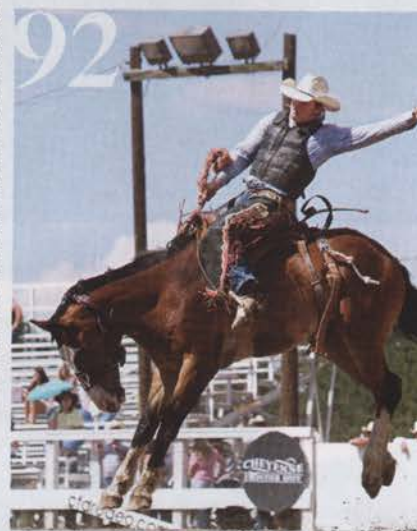
Let's Get Festive! Celebrate the lobster, jazz, rodeo and more