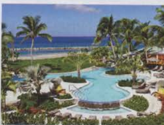
72 Top Caribbean Resorts They're not just for couples!