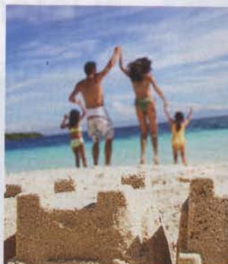
68 Best USA Beaches Dip your toes in these close-to-home waters