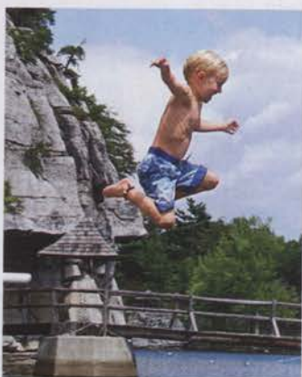
54 12 Best Family Resorts Places dedicated to fun for everyone