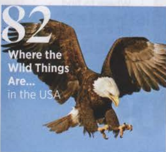
82 Where the Wild Things Are... in the USA