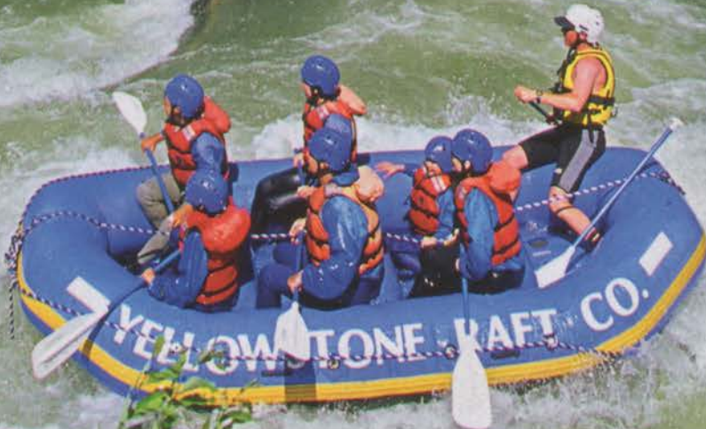
Gallatin River, Montana