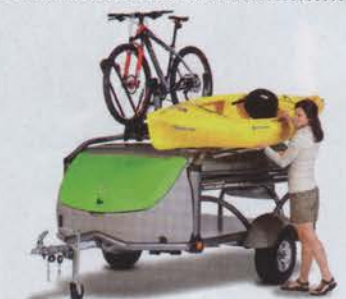
42 Gear Up What you'll need on your camping trip