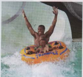
64 Wildest Water Parks They take H2O to an entirely new level