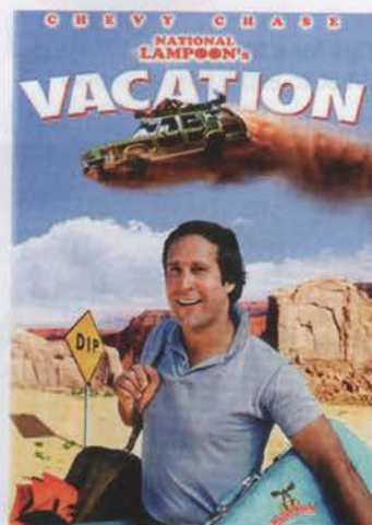
96 Reel-Life Vacations Great movies if you can't get away