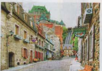
46 Oh Canada Head north for a foreign vacation not too far away