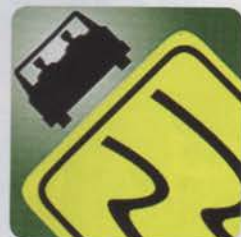
APPy Trails Help is as close as your smartphone