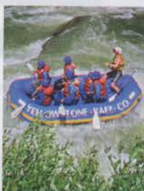
80 White-Water Adventures River rafting is a thrill a minute