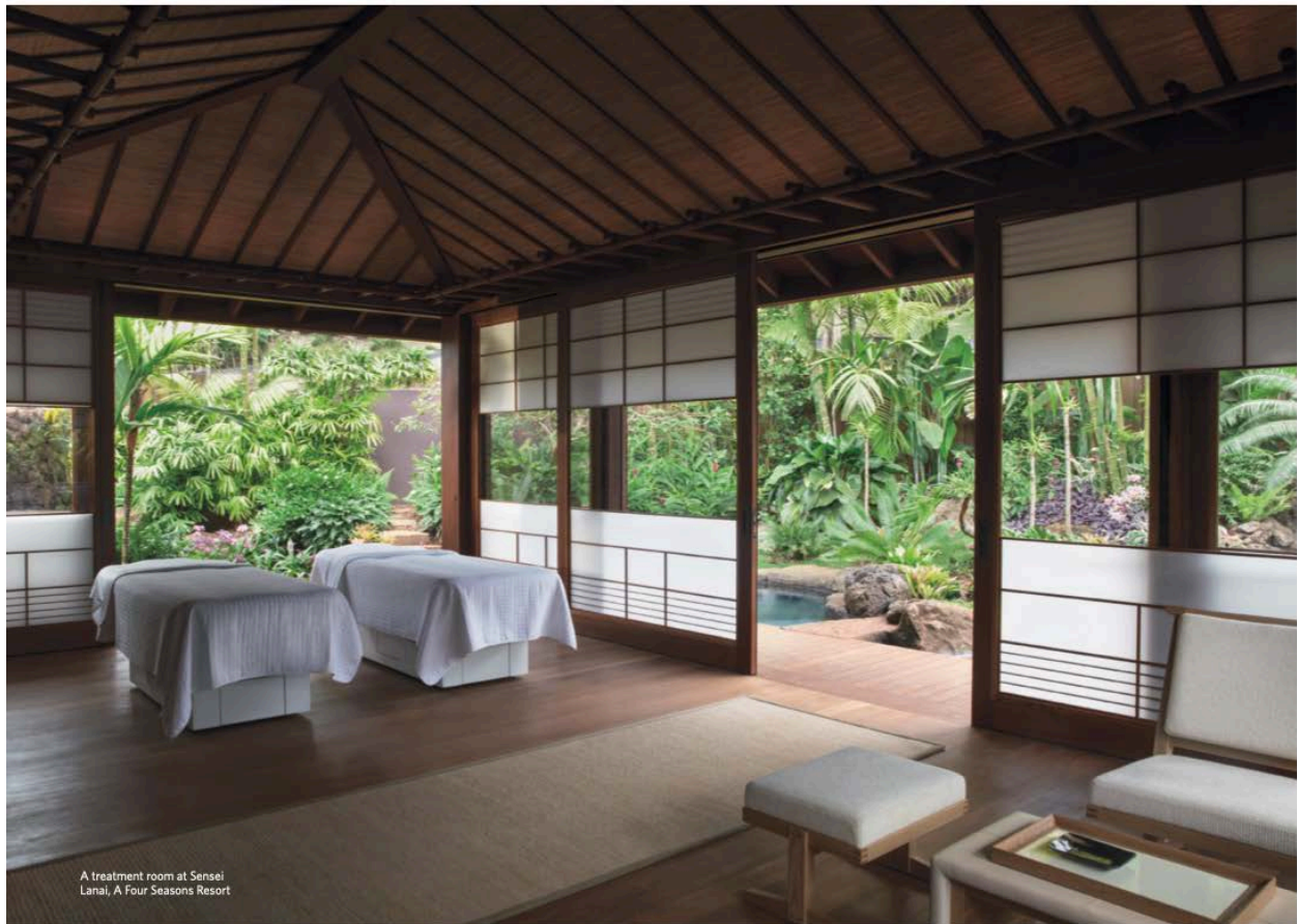
A treatment room at Sensei Lanai, A Four Seasons Resort

Like everyone else, the spa industry had a chance to pause during the pandemic and reinvent itself. While spa trends are ever-evolving, most experts agree that in 2022 spa-goers began to demand more personalized services, as well as more avenues to healthiness via sleep cures, nutrition counseling, fitness regimes and mindfulness. With mental health issues being a dreaded aftereffect of the Covid-19 era, many of us have been keen to find ways to alleviate stress and embrace harmony. While Sensei Lanai, A Four Seasons Resort talks about reconnecting to discover “what it means to live again,” Lake Austin Spa Resort advocates the healing power of being around water. We’ve talked to leaders at both destination resorts, and discovered new treatments and spa locations to pencil into your list.