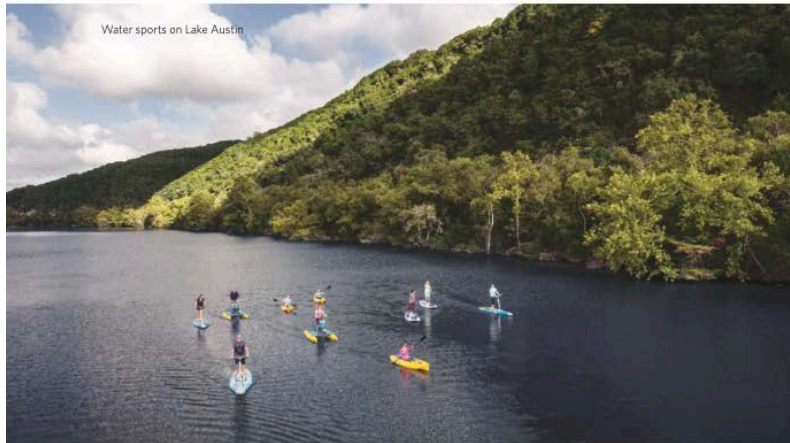
Water sports on Lake Austin