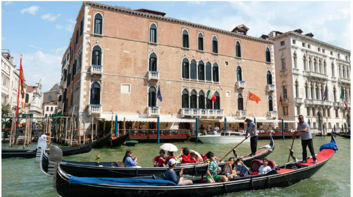
Venice, Italy - August 9, 2013: gondolas and water traffic in front of the Gritti Palace Hotel, one... [+]

In partnership with Save Venice, an American non-profit organization focused on preserving art and architecture in Venice, The Gritti Palace, a Luxury Collection Hotel, Venice, is a lead sponsor in a major project for the city. The official details will be announced early next year, but the Marriott Bonvoy hotel hopes to cement its role as a former, noble private residence and as a hotel, a major center for social events and patron of the arts. With 61 rooms and 21 suites, several with Grand Canal views and inspired by past guests or visitors like Ernest Hemingway and Somerset Maugham, the hotel and Palazzo Gritti have strong cultural roots in the city. At the moment, Save Venice has more than 40 art and architecture restorations for at-risk pieces and buildings underway. Over the past decade, more than $18 million has been invested to support everything from historic churches to individual paintings, frescoes, sculptures and manuscripts.