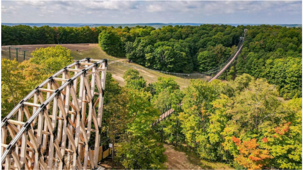
The SkyBridge Michigan opened on Oct. 15. SKYBRIDGE MICHIGAN

Boyne Mountain Resort is home to the world's longest timber-towered suspension bridge, which opens this month. Named SkyBridge Michigan, the 1,200 foot pedestrian bridge sits between the peaks of McLouth and Disciples Ridge and will be open year-round. Visitors start by riding a chairlift ride to the mountain top before a thrilling open-air walk across the suspended five-foot-wide walking surface, which dangles almost 118 feet above the valley floor. On either side, the bridge is supported by two 52-feet tall timber towers. The resort is also home to Michigan's largest indoor water park, two golf courses and an 18,500 sq ft spa.