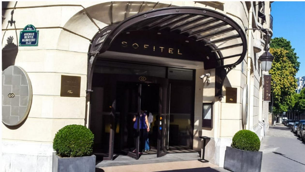
The entrance to the Hotel Sofitel Arc de Triomphe in Paris

The French hotel brand Sofitel Hotels & Resorts and famous fashion magazine are tying up for a three-year partnership focused on “mastering art de vivre.” Sofitel has always been focused on its French heritage, and this ongoing program will include various public festivals, fashion collaborations and beauty-inspired programs. The first event takes place in Paris as the Vogue x Sofitel Festival this weekend. Coming soon are additional events at Sofitel New York and Sofitel Washington DC Lafayette Square with Vogue US. Another immediate initiative includes a partnership with Grey Goose vodka, a spirit with French heritage, to create a series of exclusive cocktails for Sofitel properties worldwide.