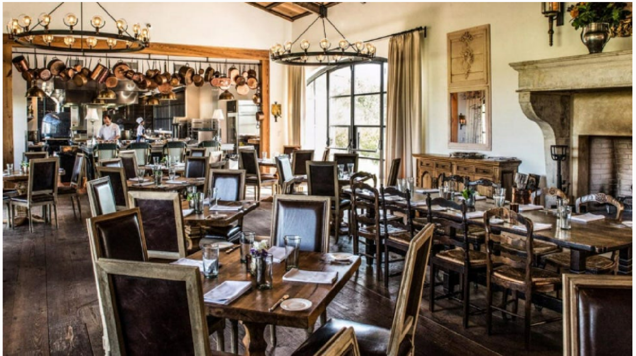
The Signature Restaurant at La Cantera Resort